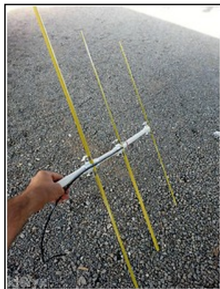
Picture of a hand-held directional 3 element Yagi antenna for ARDF.

en.wikipedia.org/wiki/Amateur_radio_direction_finding