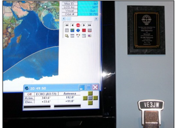
A plaque commemorating the donation of ELKEL to VE3JW, on the wall next to the large monitor, for permanent display at VE3JW.