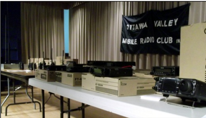
The equipment brought by Dannis was spread out over three tables. Mobile radios were on display on the first table, portable radios on the second and accessories on the third.