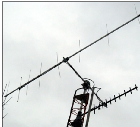
VE2DBX satellite antennas and rotors

Yagis, mounted them on an azimuth rotor placed horizontally so that he could servo it up and down for elevation. Below this rotor, he used another azimuth rotor to turn his antennas 360 degrees. He built a control box for the two rotors and showed me the professional drawings that he drafted for the control. He used Sun readings to orientate his system.