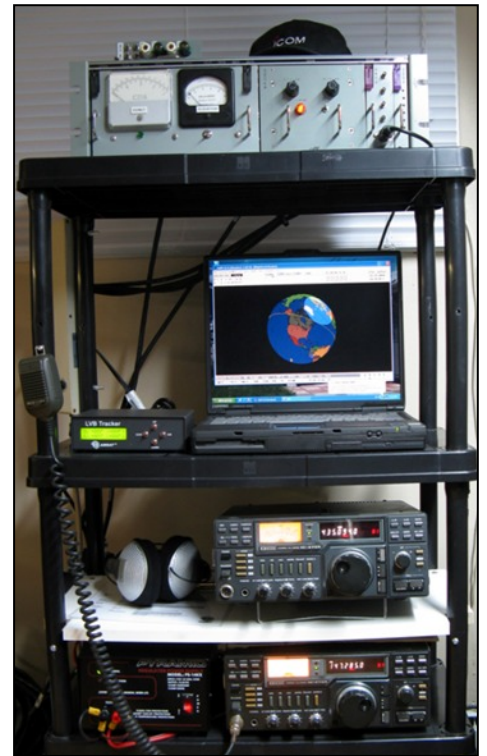
VE2DBX satellite station